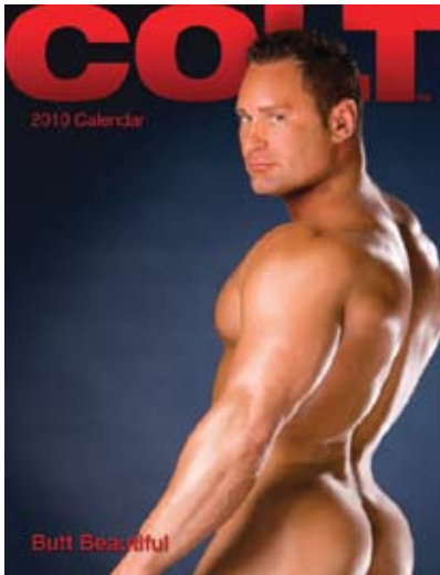
CBB10 Butt Beautiful